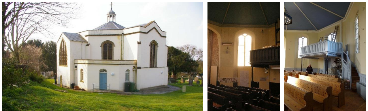
External render was repaired. Internal walls, ceiling, lighting and joinery before and after completion of the works.

This octagonal Grade II listed Gothic Revival building is a rare example of a rural Georgian chapel.