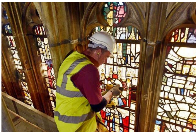
Top bosses before and after cleaning. Bottom glazing repairs and Cathedral project team inspection.

The Cathedral is a busy public venue so the programming included timing key aspects, particularly of the lift installation, around Holy Week celebrations. Access routes were carefully managed to enable the Cathedral to stay safely open to visitors throughout the major works. This project included a strong element of public engagement about the works with fundraising, tours and social media.