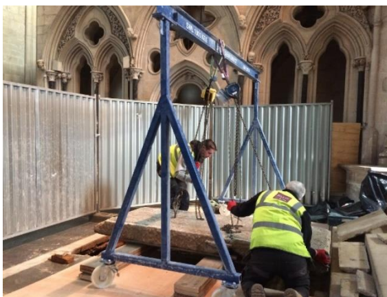
(l) Lifting floor tiles and laying underfloor heating in the lady Chapel. (r) Lifting the ledger stones.