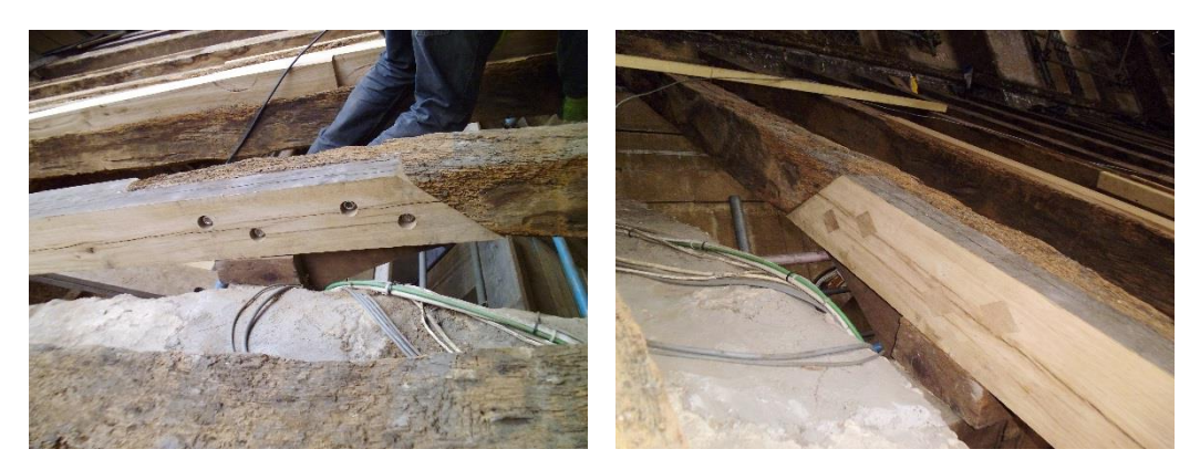
Further timber repair details

We stripped, recast and relaid the lead roof including bays, flashings, guttering, and details including a lead step detail and ornamental features. We unblocked the chutes from the main north nave roof to discharge water.