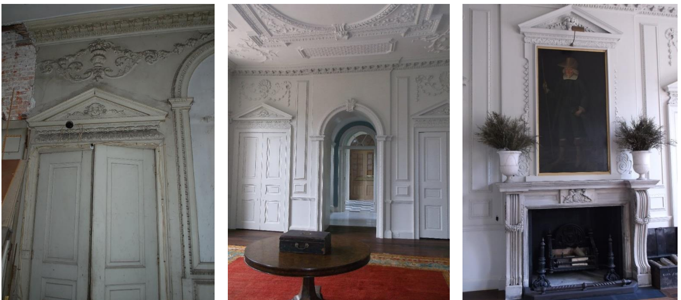
From left: Plasterwork that could be saved was restored throughout. In the White Room, a clean and effortless link is made to the new apartment and Loggia. The fireplace was reinstalled. New decorative stonework and joinery repairs frame the portrait blending with surrounding plasterwork and panelling.

Restored plasterwork, joinery repairs and carved stonework by Ellis and Company craftsmen combine in the decorative White Room, Dining Room, Stone Hall to once again show off elegant and ornate interior decoration.